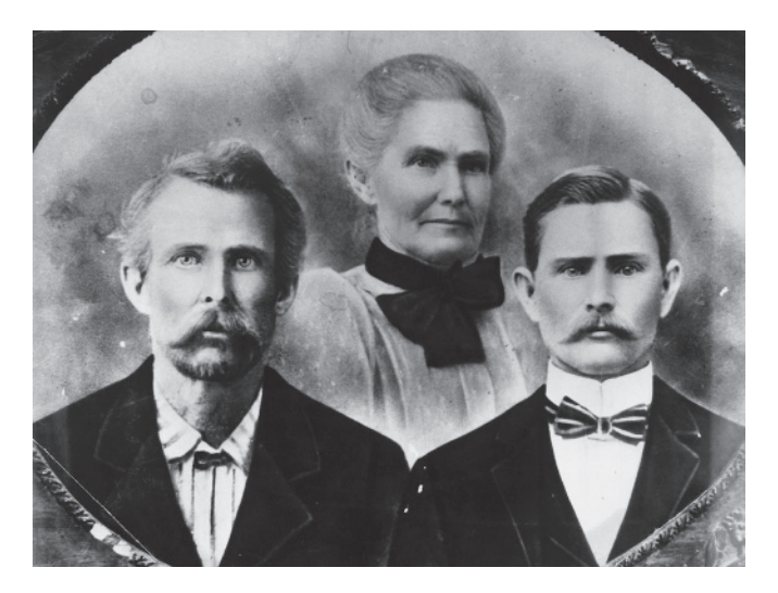
FIGURE 1.3 ► Jesse James (left), the elusive outlaw of the Wild West, helped to establish the mystique of the antihero.

As with the private eye, the spy of the 1960s enlivened espionage stories featuring such heroes as James Bond, whose popularity rivaled even that of Sherlock Holmes. In reading the material, however, readers would gain little practical insight into the mind of the criminal, the nature of crime, the science of detection, the techniques of law enforcement officers, or courtroom procedures where one is found either guilty or innocent.