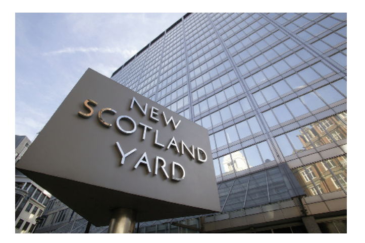
FIGURE 1.7 Scotland Yard was one of the first professional police investigative units.