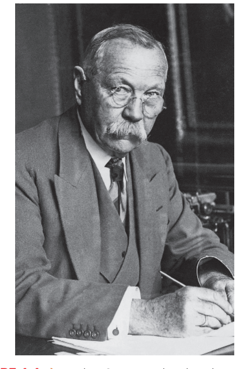
FIGURE 1.4 Arthur Conan Doyle is best known for his fictional detective Sherlock Holmes.

Sources: Doyle, Arthur Conan (1893). The Original Illustrated 'Strand' Sherlock Holmes (1989 ed.). Ware, England: Wordsworth.